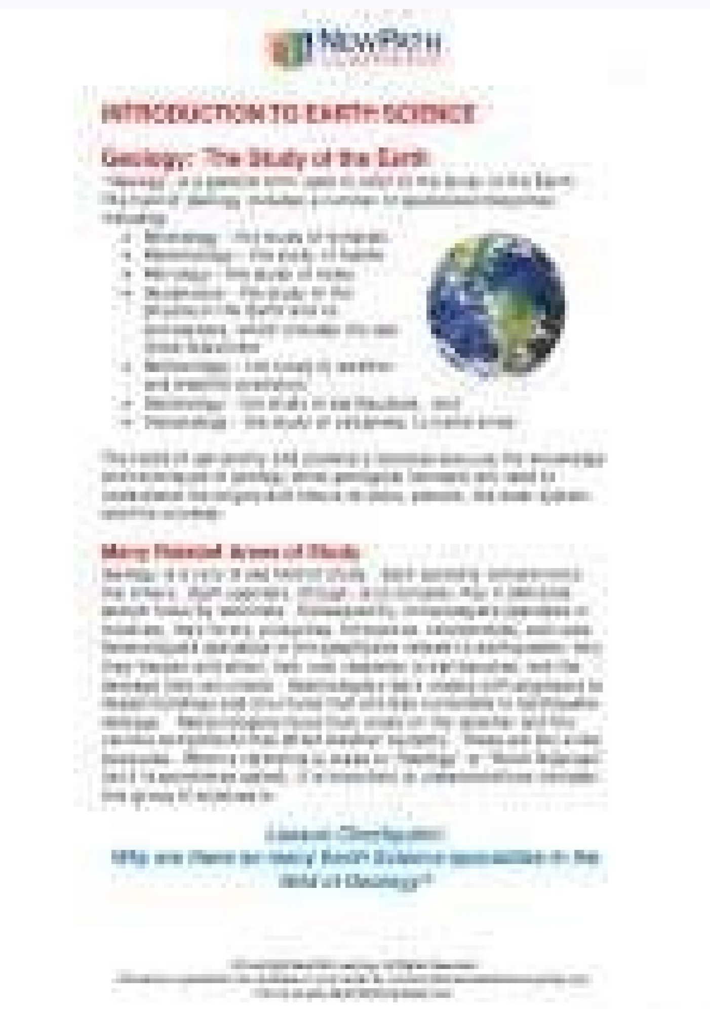
13.1 minerals and rocks worksheet answers pdf. 13.1 minerals and rocks answer key. 13.1 minerals and rocks. 13.1 minerals and rocks answers.